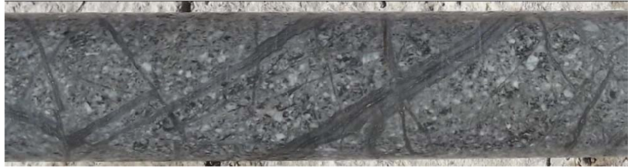
Figure 3: Drill core from RGR-12-100 at 624 m. Representative of a 3 m interval that contains 1.38 g/t Au and 0.299% Cu. Thin multidirectional banded gray veins are associated with gold-copper mineralization and contain quartz-magnetite-pyrite-minor chalcopyrite with a wall rock alteration assemblage of secondary biotite and potassium feldspar.

The quartz veins form multidirectional sheeted to stockwork arrays and are typically 0.2-1.0 cm in width with occasional veins to 5 cm in width (see the photo if Figure 3 below). Veins are commonly gray and banded with a vein assemblage of quartz-magnetite-pyrite-chalcopyrite. Wallrock alteration consists of secondary biotite and potassium feldspar. This style of veining is very similar to that seen in many other large, gold-dominant porphyry gold-copper deposits in the Andean cordillera (Cerro Corona, Lobo, Cerro Casale, and the nearby Lindero deposit of Mansfield Minerals – 11 km to the southeast of Rio Grande). A distinctly later vein set contains much higher contents of pyrite and does not appear to be associated with the gold-copper mineralization. This later pyritic vein set may also be associated with later chloritic and sericitic alteration of the wallrock.